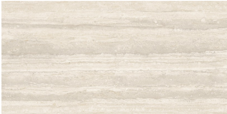
Travertino Vein White Groove Lappato Rettificato 60x120 cm

DOGMA® presents a new range of hygienic products DOGMA PROJECT ANTIBACTERIAL . The application of new technical glazes capable to stop the reproduction of bacteria guarantees antimicrobial protection to surfaces, ensuring a healthy environment, free of dirt and odor. The new technology applied to our ceramic tiles is ideal for all locations, especially with bacterial growth, such as kitchens, bars, restaurants, hotels, doctor's offices, schools, public offices, baths, SPAs and swimming pools. Ideal for personal and commercial use. DOGMA PROJECT ANTIBACTERIAL achieves the progressive elimination of bacteria by blocking growth, interrupting their life cycle.