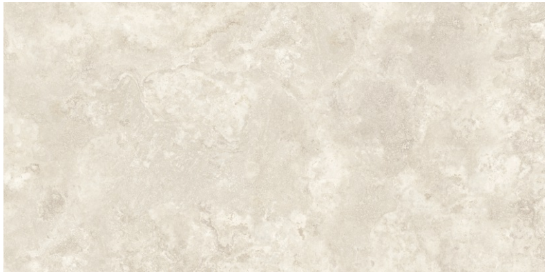
Travertino Cross White Natural 60x120 cm

DOGMA® presents a new range of hygienic products DOGMA PROJECT ANTIBACTERIAL . The application of new technical glazes capable to stop the reproduction of bacteria guarantees antimicrobial protection to surfaces, ensuring a healthy environment, free of dirt and odor. The new technology applied to our ceramic tiles is ideal for all locations, especially with bacterial growth, such as kitchens, bars, restaurants, hotels, doctor's offices, schools, public offices, baths, SPAs and swimming pools. Ideal for personal and commercial use. DOGMA PROJECT ANTIBACTERIAL achieves the progressive elimination of bacteria by blocking growth, interrupting their life cycle.