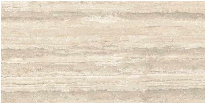
Travertino Vein Beige Groove Lappato Rettificato 60x120 cm

DOGMA® presents a new range of hygienic products DOGMA PROJECT ANTIBACTERIAL . The application of new technical glazes capable to stop the reproduction of bacteria guarantees antimicrobial protection to surfaces, ensuring a healthy environment, free of dirt and odor. The new technology applied to our ceramic tiles is ideal for all locations, especially with bacterial growth, such as kitchens, bars, restaurants, hotels, doctor's offices, schools, public offices, baths, SPAs and swimming pools. Ideal for personal and commercial use. DOGMA PROJECT ANTIBACTERIAL achieves the progressive elimination of bacteria by blocking growth, interrupting their life cycle.