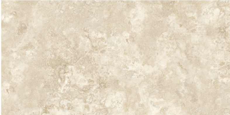
Travertino Cross Beige Natural 60x120 cm

DOGMA® presents a new range of hygienic products DOGMA PROJECT ANTIBACTERIAL . The application of new technical glazes capable to stop the reproduction of bacteria guarantees antimicrobial protection to surfaces, ensuring a healthy environment, free of dirt and odor. The new technology applied to our ceramic tiles is ideal for all locations, especially with bacterial growth, such as kitchens, bars, restaurants, hotels, doctor's offices, schools, public offices, baths, SPAs and swimming pools. Ideal for personal and commercial use. DOGMA PROJECT ANTIBACTERIAL achieves the progressive elimination of bacteria by blocking growth, interrupting their life cycle.